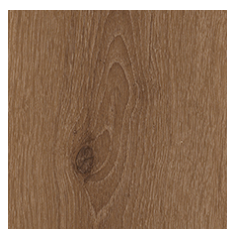
Thatch 26720 LRV 17.5