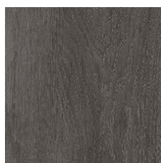
Coarse 26595 LRV 14.5