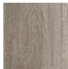
Shade 26506 LRV 29