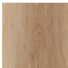
Spindle 26140 LRV 38.3