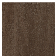
Brew 26740 LRV 14.8