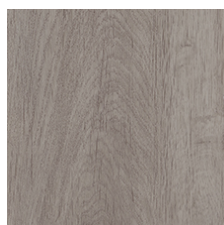
Beech 26502 LRV 36.8