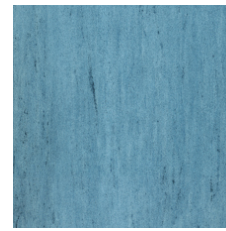
Wash 27436 LRV 23.7 | L* 55.77