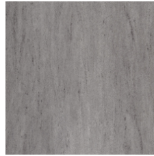
Gesso 27520 LRV 35.6 | L* 66.21