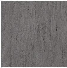
Caster 27518 LRV 23.2 | L* 55.33