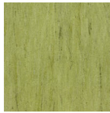
Graze 27326 LRV 31.5 | L* 62.9