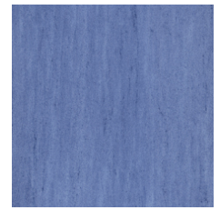
Sapphire 27486 LRV 17.2 | L* 48.51