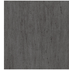
Cornerstone 27585 LRV 13.5 | L* 43.45