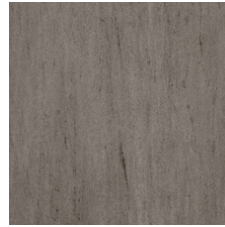
Pour 27530 LRV 21.9 | L* 53.97