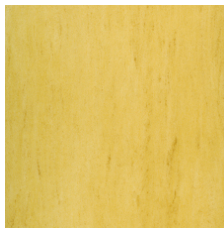
Lure 27201 LRV 49.4 | L* 75.67