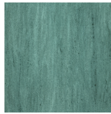
Jade 27405 LRV 20.8 | L* 52.74