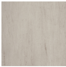
Plaster 27111 LRV 53.2 | L* 77.99