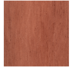
Stoke 27855 LRV 19.7 | L* 51.54