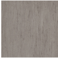
Silt 27504 LRV 31.9 | L* 63.25