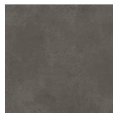
Sediment 15595 LRV 11.7