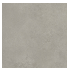
Cashmere 15114 LRV 40.7