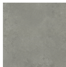
Gravel 15530 LRV 23.1