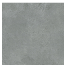
Cement 15518 LRV 24.1