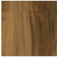
Acacia 00201 V4 - Substantial Variation