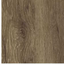
Chattahoochee Oak 00504 V4 - Substantial Variation