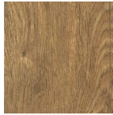
Vintage Oak 00205 V2 - Slight Variation