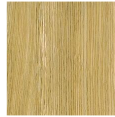
Limerick Oak 00207 V3 - Moderate Variation