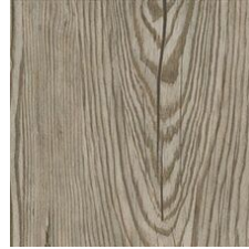
Wimena Pine 00506 V2 - Slight Variation