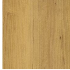
Allegheny Maple 00505 V4 - Substantial Variation