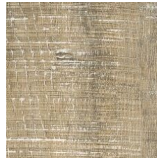
Weathered Oak 00206 V3 - Moderate Variation