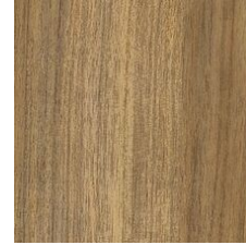
Oconee Walnut 00507 V4 - Substantial Variation