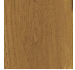
Gallatin Hickory 00508 V4 - Substantial Variation