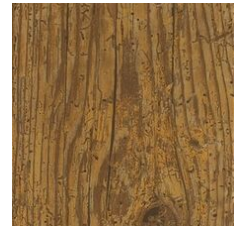
Apalachicola Pine 00501 V4 - Substantial Variation