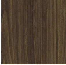
Targhee Walnut 00503 V1 - Uniform Appearance