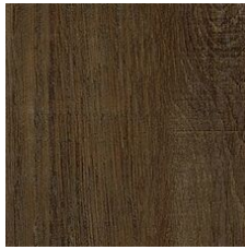
Mocha Oak 00202 V3 - Moderate Variation