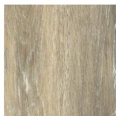
Willamette Oak 00707 LRV 31.6 | L* 62.98 V4 - Substantial Variation