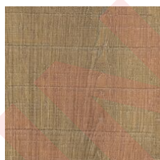
Hoosier Oak 00704 LRV 15.4 | L* 46.19 V2 - Slight Variation