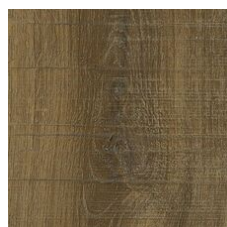
Gifford Oak 00703 LRV 11 | L* 39.5 V3 - Moderate Variation