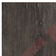
Prescott Oak 00708 LRV 16.9 | L* 48.14 V4 - Substantial Variation