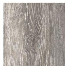
Sawtooth Oak 00706 LRV 16.5 | L* 47.57 V4 - Substantial Variation