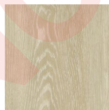
Inyo Oak 00705 LRV 42.3 | L* 71.1 V3 - Moderate Variation