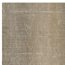
Monterey Oak 00211 LRV 23.4 | L* 55.44 V2 - Slight Variation