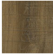
Gifford Oak 00703 LRV 11 | L* 39.5 V3 - Moderate Variation