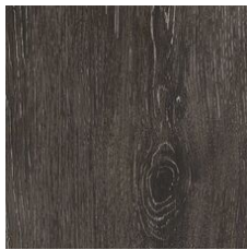
Prescott Oak 00708 LRV 16.9 | L* 48.14 V4 - Substantial Variation