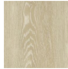
Inyo Oak 00705 LRV 42.3 | L* 71.1 V3 - Moderate Variation