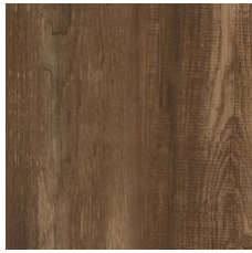
Cerused Oak 00210 LRV 9.9 | L* 37.66 V2 - Slight Variation