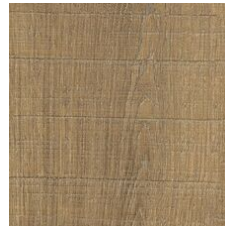
Hoosier Oak 00704 LRV 15.4 | L* 46.19 V2 - Slight Variation