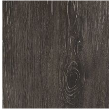
Prescott Oak 00708 LRV 16.9 | L* 48.14 V4 - Substantial Variation