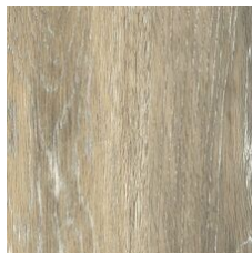
Willamette Oak 00707 LRV 31.6 | L* 62.98 V4 - Substantial Variation