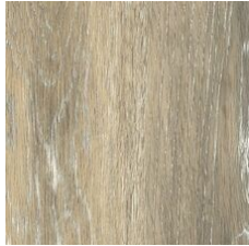
Willamette Oak 00707 LRV 31.6 | L* 62.98 V4 - Substantial Variation