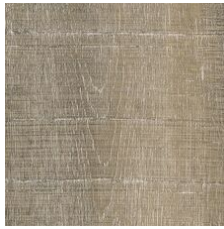
Monterey Oak 00211 LRV 23.4 | L* 55.44 V2 - Slight Variation