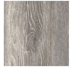
Sawtooth Oak 00706 LRV 16.5 | L* 47.57 V4 - Substantial Variation