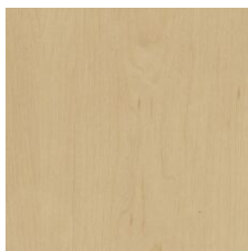
Bare 64200 LRV 43 V2 - Slight Variation