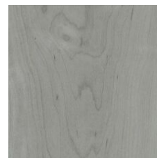
Weathered 64518 LRV 31.8 V2 - Slight Variation