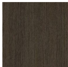
Chickory 64752 LRV 7.3 V2 - Slight Variation