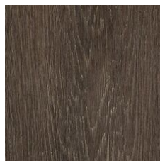
Russet 64760 LRV 7.9 V2 - Slight Variation