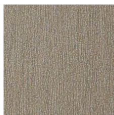
Glow 64105 LRV 36.8