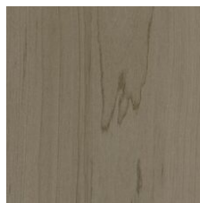
Fog 64327 LRV 22 V3 - Moderate Variation