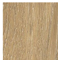
Buff 64140 LRV 30.3 V2 - Slight Variation