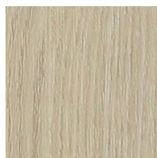
Parchment 64111 LRV 43.4 V2 - Slight Variation