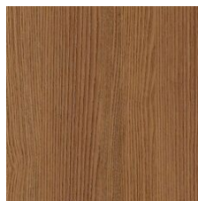
Ginger 64820 LRV 16.7 V2 - Slight Variation