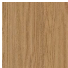
Honey 64240 LRV 25.6 V2 - Slight Variation