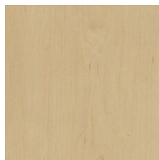
Bare 64200 LRV 43 V2 - Slight Variation