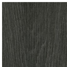
Char 64549 LRV 7.4 V2 - Slight Variation