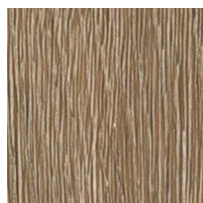
Cocoa 64103 LRV 20.3 V2 - Slight Variation