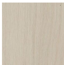
Alabaster 64114 LRV 47.9 V3 - Moderate Variation