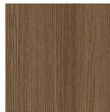
Bark 64720 LRV 14.1 V2 - Slight Variation