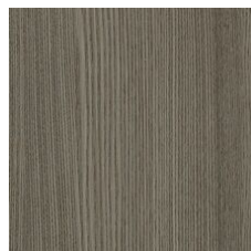
Antler 64761 LRV 18.5 V2 - Slight Variation