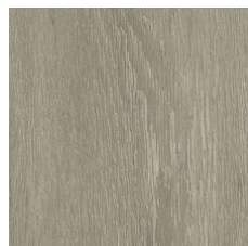
Ashen 64155 LRV 27.7 V2 - Slight Variation