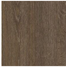
Tannery Brown 06002 LRV 10.3 | L* 38.4 V2 - Slight Variation