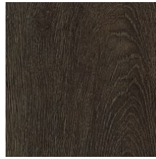
Summer Truffle 06003 LRV 9.2 | L* 36.34 V2 - Slight Variation