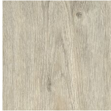
Cremini 06008 LRV 35.6 | L* 66.23 V3 - Moderate Variation