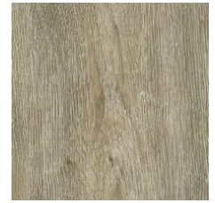
Bone 06006 LRV 23 | L* 55.05 V4 - Substantial Variation