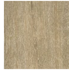
Ivory 06005 LRV 25.4 | L* 57.48 V2 - Slight Variation