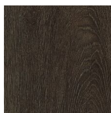
Summer Truffle 06003 LRV 9.2