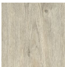
Cremini 06008 LRV 35.6