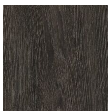
Abyss 06004 LRV 6.6