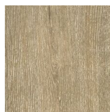
Ivory 06005 LRV 25.4