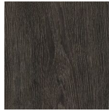
Abyss 06004 LRV 6.6 | L* 30.97 V3 - Moderate Variation