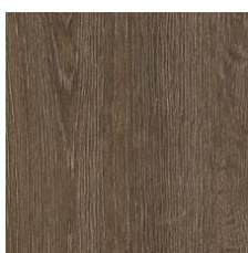
Tannery Brown 06002 LRV 10.3