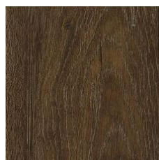
Morchella 06007 LRV 9.5