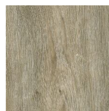
Bone 06006 LRV 23