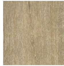
Ivory 06005 LRV 25.4 | L* 57.48 V2 - Slight Variation