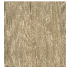
Ivory 06005 LRV 25.4 | L* 57.48 V2 - Slight Variation