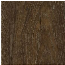
Morchella 06007 LRV 9.5 | L* 36.84 V2 - Slight Variation