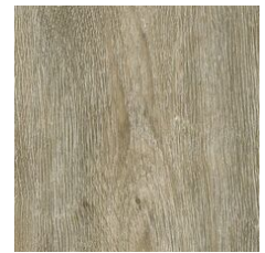
Bone 06006 LRV 23 | L* 55.05 V4 - Substantial Variation