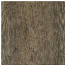
Cinnamon 06001 LRV 14.9 | L* 45.47 V3 - Moderate Variation