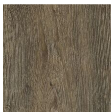
Cinnamon 06001 LRV 14.9 | L* 45.47 V3 - Moderate Variation