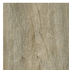
Bone 06006 LRV 23 | L* 55.05 V4 - Substantial Variation