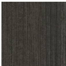
True Black 04001 V2 - Slight Variation