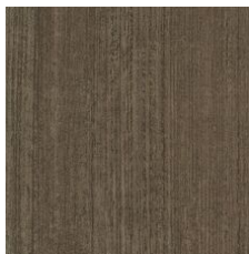
Dulled Flint 04002 V2 - Slight Variation