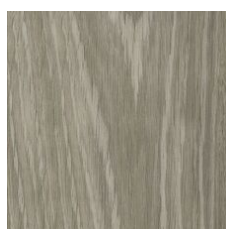
Express 03002 V3 - Moderate Variation