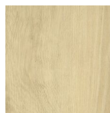
Elucidate 03006 V4 - Substantial Variation