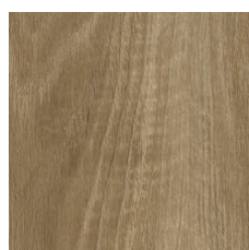
Specify 03001 V4 - Substantial Variation