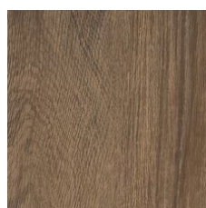
Exemplify 03004 V3 - Moderate Variation