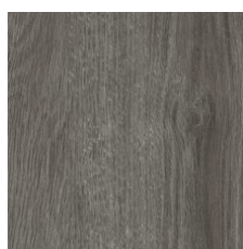
Detail 03005 V3 - Moderate Variation