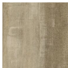
Identify 03010 V4 - Substantial Variation