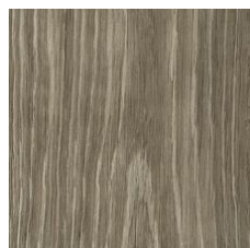
Distinguish 03008 V4 - Substantial Variation