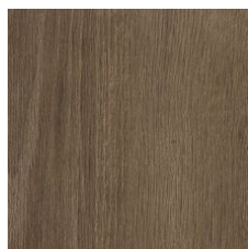
Differentiate 03009 V3 - Moderate Variation