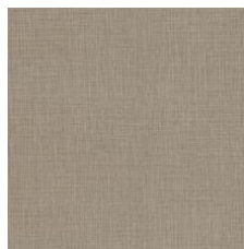
Stepping Stone 96700 Weldrod 02001