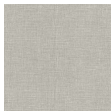
Pebble 96114 Weldrod 07332