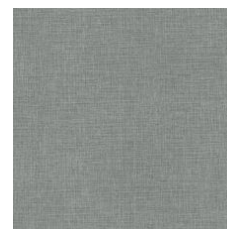
Tidal Basin 96440 Weldrod 02003