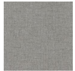
Pagoda 96710 Weldrod 05244