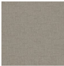
Tea Garden 96216 Weldrod 07332