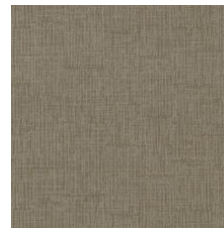
Stepping Stone 96700 Weldrod 02019