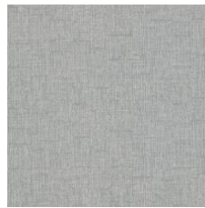
Zen 96515 Weldrod 01203