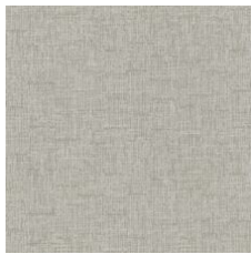
Pebble 96114 Weldrod 07332