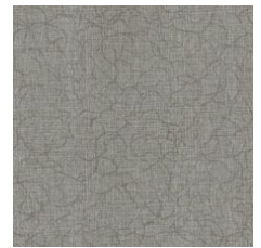
Pagoda 96710 Weldrod 05244