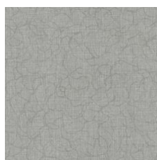
Stroll 96535 Weldrod 02012