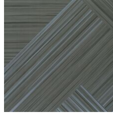
Slate Palladium 18595 V2 - Slight Variation