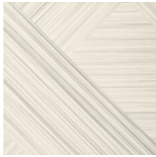
Carrara Silver 18100 V2 - Slight Variation