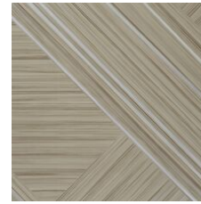
Element Platinu 18506 V2 - Slight Variation