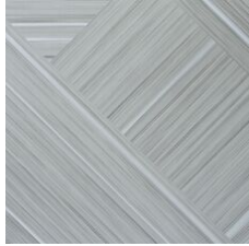
Talc Platinum 18535 V2 - Slight Variation