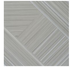
Forge Platinum 18518 V2 - Slight Variation