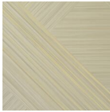
Alabaster Gold 18111 V2 - Slight Variation