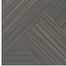
Cornerstone Cop 18555 V2 - Slight Variation