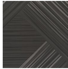
Onyx Silver 18505 V2 - Slight Variation