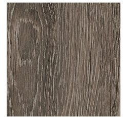
Urban Ash 48540 V2 - Slight Variation