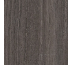
Umber 48761 LRV 11 V2 - Slight Variation