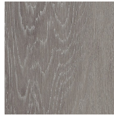
Smoke 48506 LRV 26.3 V2 - Slight Variation