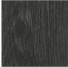
Char 48549 LRV 7.2 V2 - Slight Variation