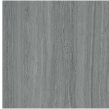
Pewter 48595 LRV 22.6 V2 - Slight Variation