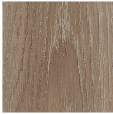
Cocoa 48103 LRV 20.8 V2 - Slight Variation