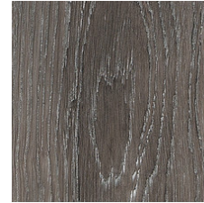
Woodland 48760 LRV 17.2 V2 - Slight Variation