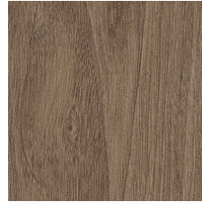
Mink 48720 LRV 16.8 V3 - Moderate Variation