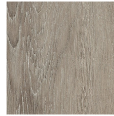
Fawn 48516 LRV 25.7 V2 - Slight Variation