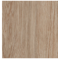
Natural 48250 LRV 28.7 V2 - Slight Variation