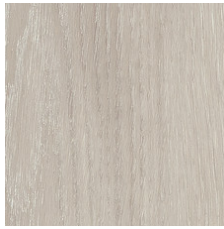
Cottonwood 48120 LRV 42.5 V2 - Slight Variation