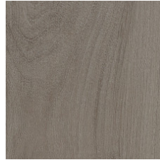
French Grey 48599 LRV 20.8 V3 - Moderate Variation