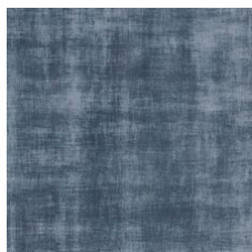
Iconic 92429 V2 - Slight Variation