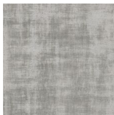
Mirror 92535 LRV 24.5 | L* 56.55 V2 - Slight Variation