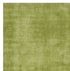
Linden 92325 V2 - Slight Variation