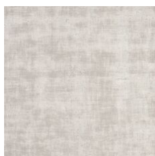
Alabaster 92100 LRV 46.1 | L* 73.63 V2 - Slight Variation