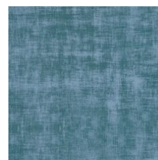
Reflect 92405 V2 - Slight Variation