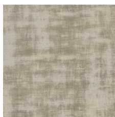
Bone 92156 V2 - Slight Variation