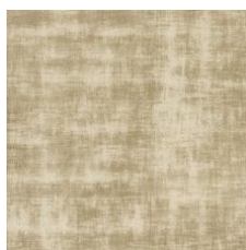
Urn 92155 V2 - Slight Variation