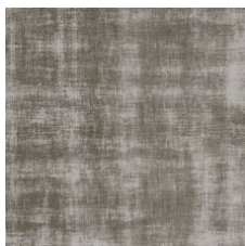
Linen 92504 V2 - Slight Variation