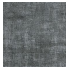
Relic 92595 V2 - Slight Variation