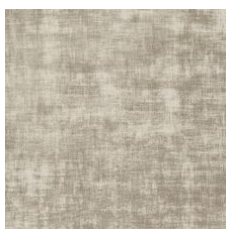
Ceramic 92144 V2 - Slight Variation