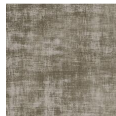
Antique Bronze 92760 V2 - Slight Variation