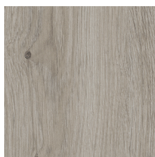
Refuge 26155 LRV 20.9 V3 - Moderate Variation