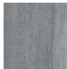
Thistle 26535 LRV 25.5 V3 - Moderate Variation