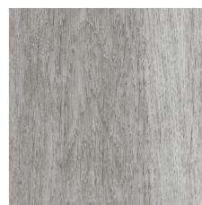
Shade 26506 LRV 29 V3 - Moderate Variation