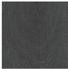
Raw 26549 LRV 8.2 V2 - Slight Variation