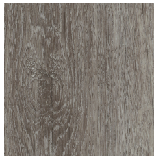
Brew 26740 LRV 14.8 V3 - Moderate Variation