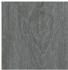
Coarse 26595 LRV 14.5 V3 - Moderate Variation