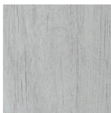
Beech 26502 LRV 36.8 V3 - Moderate Variation