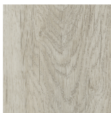
Nestle 26120 V3 - Moderate Variation