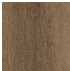
Thatch 26720 LRV 17.5 V3 - Moderate Variation