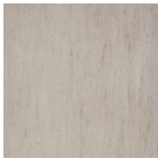
Plaster 27111 LRV 53.2 | L* 77.99 V2 - Slight Variation