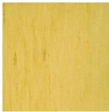
Lure 27201 LRV 49.4 | L* 75.67 V2 - Slight Variation