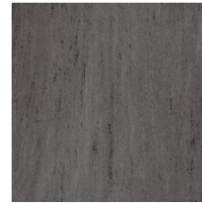
Cornerstone 27585 LRV 13.5 | L* 43.45 V2 - Slight Variation