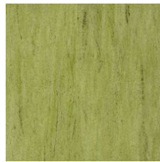
Graze 27326 LRV 31.5 | L* 62.9 V2 - Slight Variation