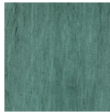
Jade 27405 LRV 20.8 | L* 52.74 V2 - Slight Variation