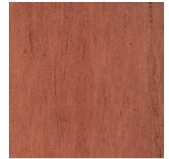
Stoke 27855 LRV 19.7 | L* 51.54 V2 - Slight Variation