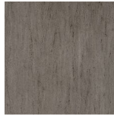
Pour 27530 LRV 21.9 | L* 53.97 V2 - Slight Variation