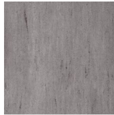
Gesso 27520 LRV 35.6 | L* 66.21 V2 - Slight Variation