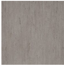
Silt 27504 LRV 31.9 | L* 63.25 V2 - Slight Variation