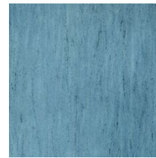
Wash 27436 LRV 23.7 | L* 55.77 V2 - Slight Variation