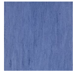
Sapphire 27486 LRV 17.2 | L* 48.51 V2 - Slight Variation