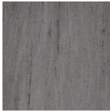
Caster 27518 LRV 23.2 | L* 55.33 V2 - Slight Variation