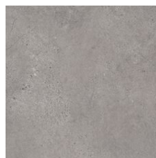
Rugged Platinum 03503 LRV 23.2