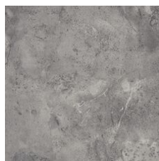
Forged Concrete 03507 LRV 22.1