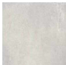
Misty Quartz 03501 LRV 51.2