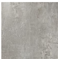
Tempered Concre 03502 LRV 28.1