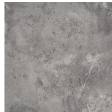
Forged Concrete 03507 LRV 22.1