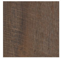
Buckeye 00710 LRV 12.5 | L* 42.02