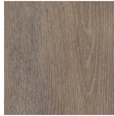
Chalet 00755 LRV 22.4 | L* 54.46