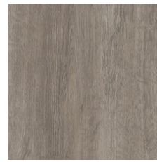
Stony Oak 00516 LRV 25.8 | L* 57.86