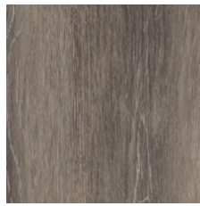
Grand Teton 00506 LRV 33.9 | L* 64.92