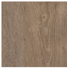
Orchard 00103 LRV 24.4 | L* 56.52