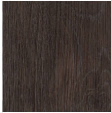
Bison 00751 LRV 10.3 | L* 38.36