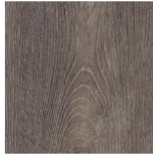
Landscape 00760 LRV 18.6 | L* 50.2