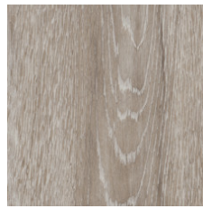
Cascade 00120 LRV 41.4 | L* 70.47