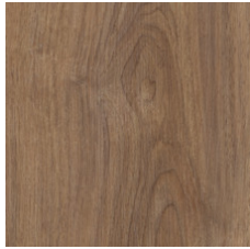
Spice 00720 LRV 18.2 | L* 49.75