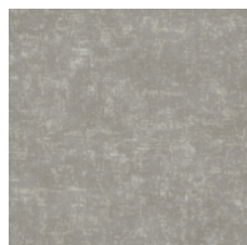
Flax 95114 V1 - Uniform Appearance