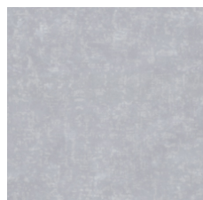
Dove 95104 V1 - Uniform Appearance