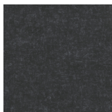
Core 95595 V1 - Uniform Appearance