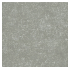
Field 95330 V1 - Uniform Appearance