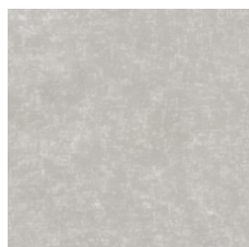
Natural 95110 V1 - Uniform Appearance