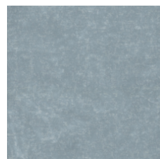
Mist 95405 V1 - Uniform Appearance