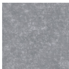
Mineral 95760 V1 - Uniform Appearance