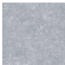
Concrete 95515 V1 - Uniform Appearance