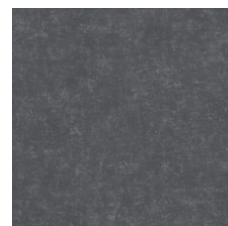
Shade 95410 V1 - Uniform Appearance