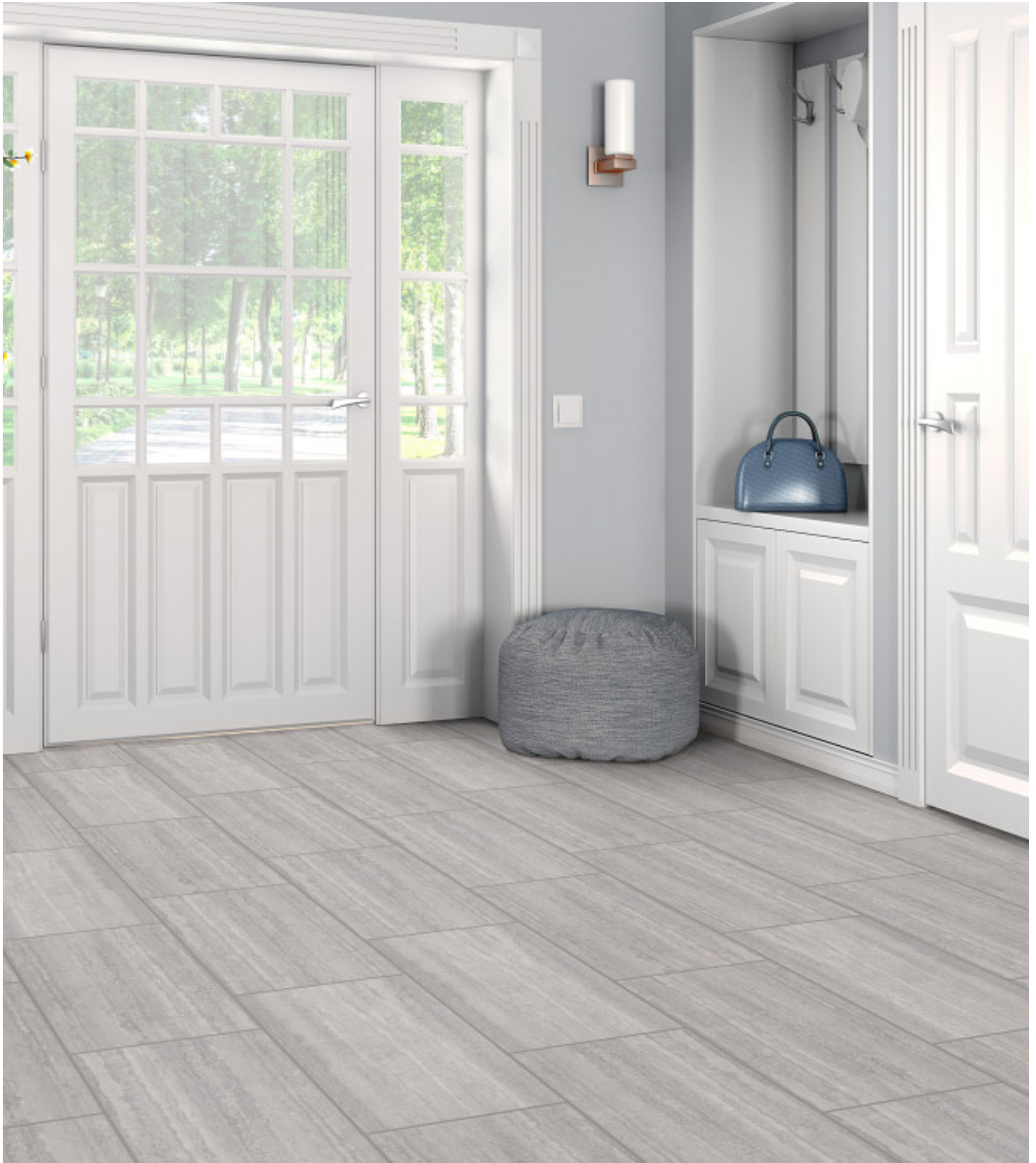
500 Light Grey