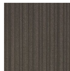
Boundary 64752 LRV 5 | L* 26.75