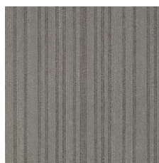
Verge 64555 LRV 11.7 | L* 40.76