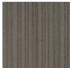
Seam 64761 LRV 8.9 | L* 35.82