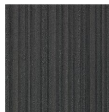
Fringe 64585 LRV 4.5 | L* 25.12