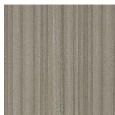
Margin 64155 LRV 16.6 | L* 47.72