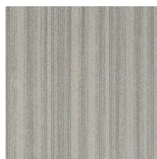
Limit 64515 LRV 23.4 | L* 55.5