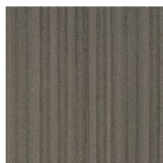
Seam 64761 LRV 8.9 | L* 35.82

3rd Party Certified in Accordance with ISO14044, ISO14025 & EN15804 HPD (Version 2.1) or C2C Silver Level (Version 4.0)