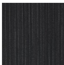
Brink 64505 LRV 2.4 | L* 17.62