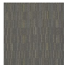
Gleam 27585 LRV 8.7 | L* 35.48