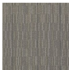
Gloss 27761 LRV 10.9 | L* 39.42