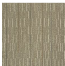
Afterglow 27755 LRV 17.9 | L* 49.42