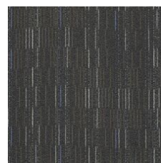
Moonlit 27505 LRV 4.4 | L* 24.85