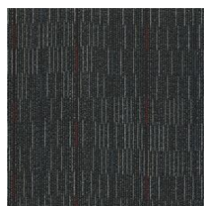
Spark 27500 LRV 4.4 | L* 24.97