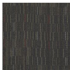
Bronzed 27750 LRV 5.1 | L* 26.92