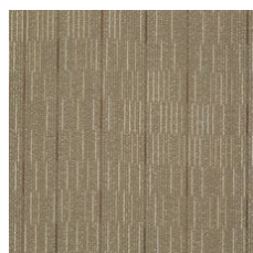
Golden 27150 LRV 14.3 | L* 44.62