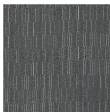
Flashpoint 27485 LRV 7 | L* 31.78