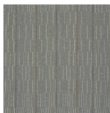
Starlight 27504 LRV 15.2 | L* 45.85