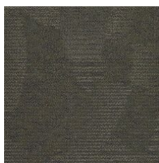
Urban Jungle 58335