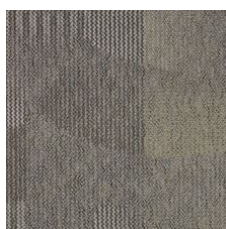
Silver Lining 58530