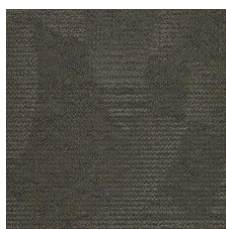
Urban Jungle 58335