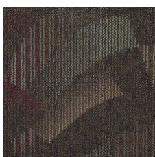
Color My World 58500