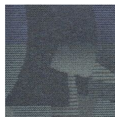
Make A Splash 58460