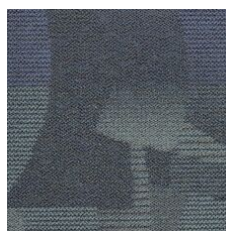
Make A Splash 58460