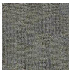
Fused Glass 58315