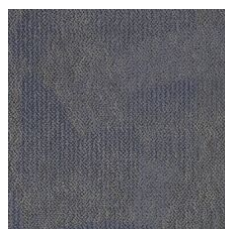
Absolute Blu 58402