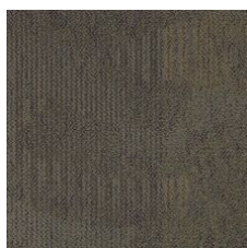
Chocolate Cravi 58761