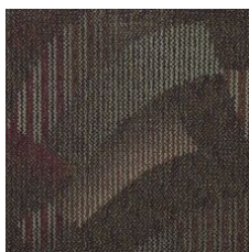
Color My World 58500