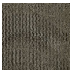
Metal Guru 58595