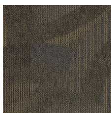
Black To Busine 58505