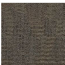
Copper Frost 58760