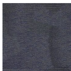
Be Jeweled 58485