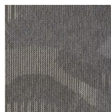
Sheer Magnetic 58585