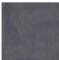
Absolute Blu 58402