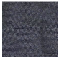
Be Jeweled 58485