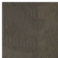
Chocolate Cravi 58761