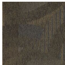
Black To Busine 58505