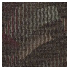
Color My World 58500