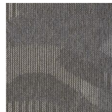
Sheer Magnetic 58585