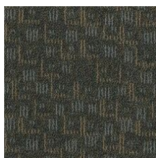
Steeling Beauty 40500