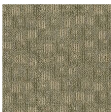
Exotic Seasalt 40315