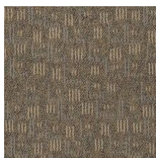
Bare Necessitie 40150