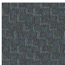
Harbouring Desi 40485