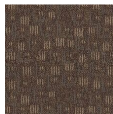
Ciao Bella 40855