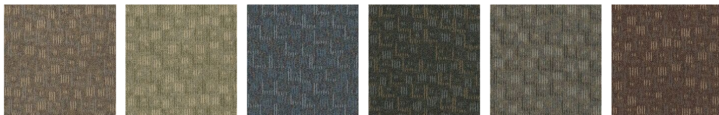
Bare Necessitie 40150