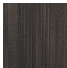
Tortoise Shell 64740