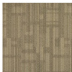
Porcelain 62103 LRV 14.8 | L* 45.3