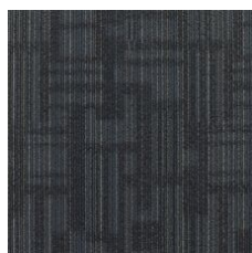
Blue Moon 62486 LRV 3.7 | L* 22.79