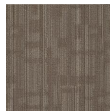
Earthenware 62750 LRV 7.8 | L* 33.55