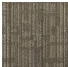
Pottery 62755 LRV 8.2 | L* 34.38

Quick Ship 2 semaines - jusqu'à 2 500 mètres carrés des États-Unis