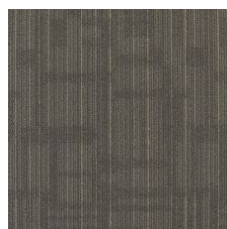
Moonstone 62500 LRV 6.3 | L* 30.24