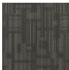
Oxide 62505 LRV 4 | L* 23.77