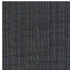
Blue Moon 62486