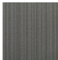
Sea Glass 62560