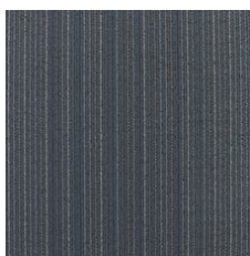
Blue Moon 62486