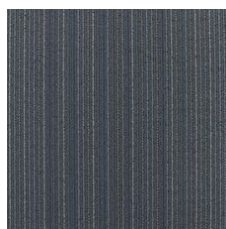
Blue Moon 62486