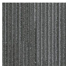
Charcoal Black 07505