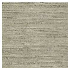
Natural Silk 99111