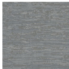
Talc 33535 LRV 18.9 | L* 50.62