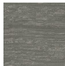
Forge 33518 LRV 12.9 | L* 42.62