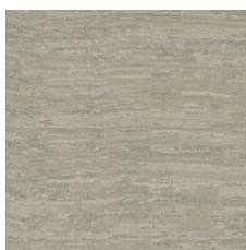
Alabaster 33111 LRV 24.3 | L* 56.41