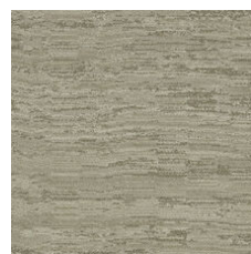
Element 33506 LRV 18.6 | L* 50.19