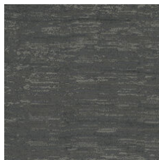
Slate 33595 LRV 5.9 | L* 29.24