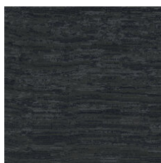
Colossal 33496 LRV 3.3 | L* 21.34