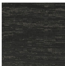
Onyx 33505 LRV 2.2 | L* 16.3