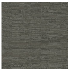
Cornerstone 33555 LRV 8.1 | L* 34.24