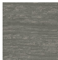
Forge 33518 LRV 12.9 | L* 42.62