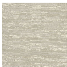
Carrara 33100 LRV 46.6 | L* 73.95