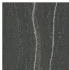
Slate Palladium 33595