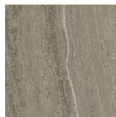
Element Platinum 33506