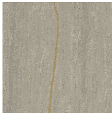
Alabaster Gold 33111