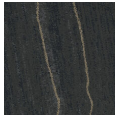
Colossal Bismuth 33496