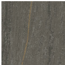
Cornerstone Copper 33555