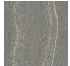
Forge Platinum 33518