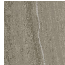
Element Platinum 33506