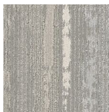
Breeze 38515 LRV 17.9 | L* 49.41