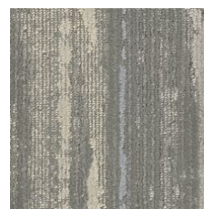
Recharge 38530 LRV 11.9 | L* 41.02