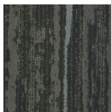
Inspire 38505 LRV 3.2 | L* 20.96