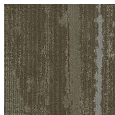
Hike 38751 LRV 8.8 | L* 35.69