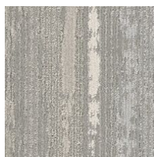
Breeze 38515 LRV 17.9 | L* 49.41